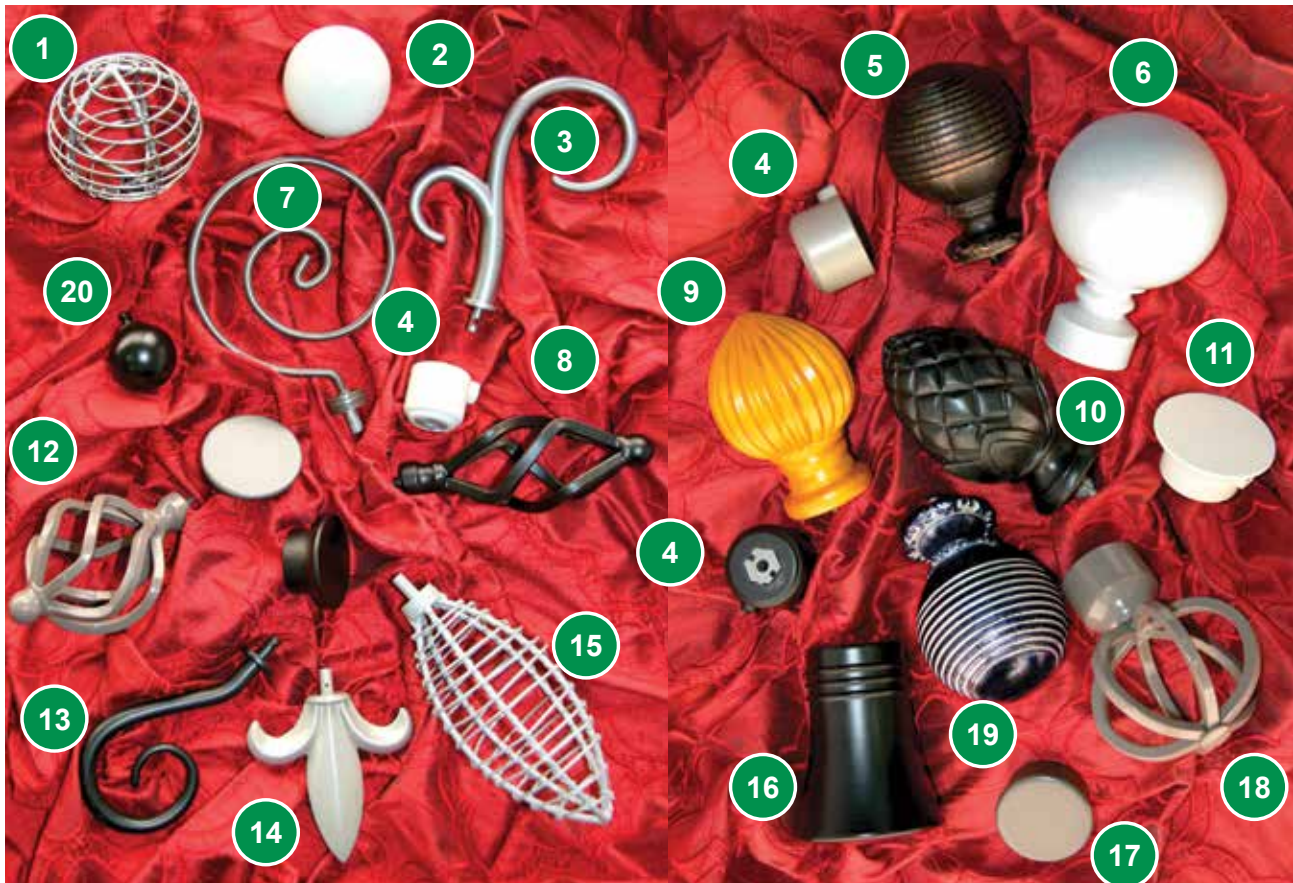
Front - Showcase fabric - Villa Nova Design: Bonbori Cornflower Colour: V3043/04. Showcase fabric - Villa Nova Design: Sarasa V3012 Colour: V3012/02