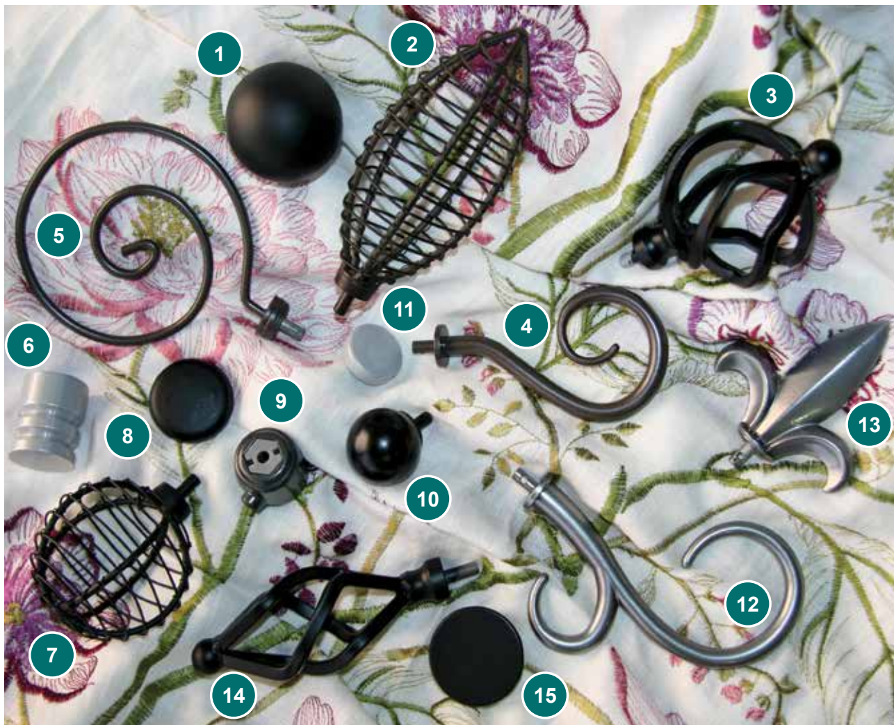
Front Cover - Showcase fabric: DiatonicCollection Design: Attica Colour: 07- Gold Showcase fabric - Lorient Decor Design: Chinoiserie Colour: Plum Cream