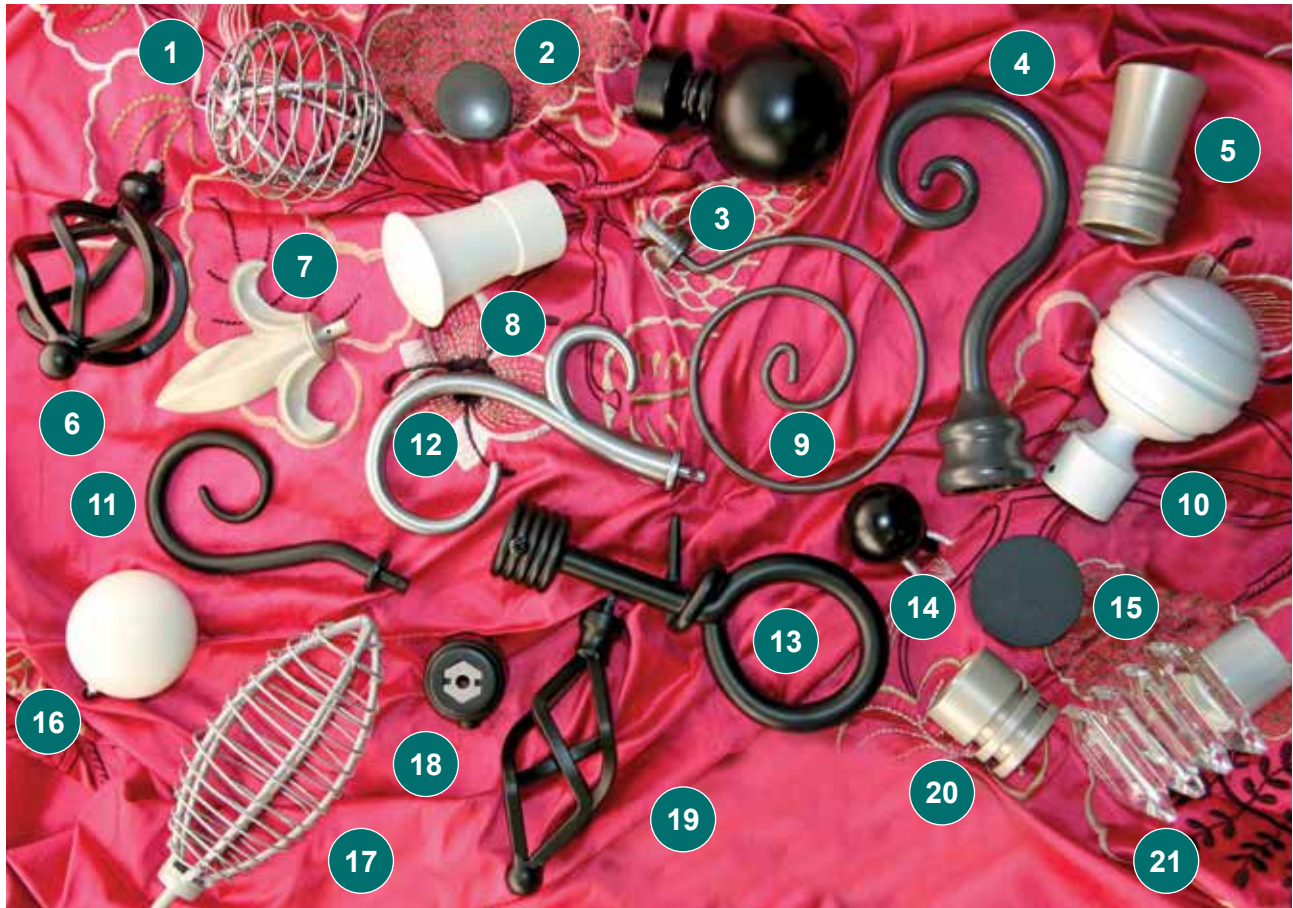
Front - Showcase fabric - Villa Nova Design: Bonbori Cornflower Colour: V3043/04. Showcase fabric - Villa Nova Design: Sarasa V3012 Colour: V3012/02