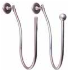
French Holdback in Diamond+Ball